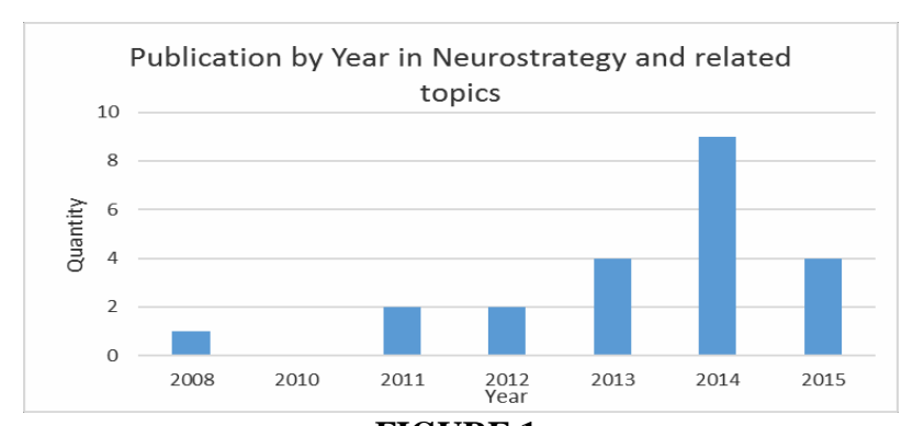
FIGURE 1 THE SUBJECTIVE CATEGORIZATION OF ARTICLES AND STUDIES IN NEUROSTRATEGY AND RELATED PAPERS

Additionally, Figure 1 shows a graph of the articles by publication year, which showed rapid growth, 2014 onwards, the number of papers related to this subject. In 2014 the number of papers leapt to 11 and backed to 8 publications in 2017.